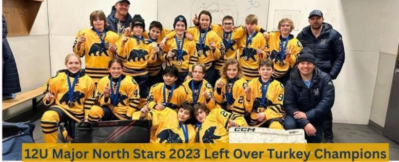
12U Major North Stars 2023 Left Over Turkey Champions