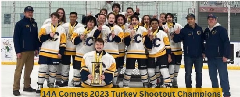
14A Comets 2023 Turkey Shootout Champions