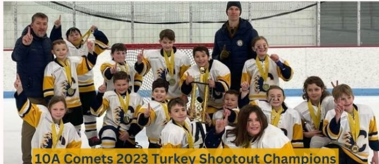
10A Comets 2023 Turkey Shootout Champions