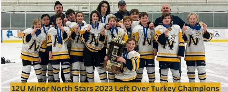
12U Minor North Stars 2023 Left Over Turkey Champions