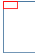
Business Card 2x3