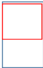
1/2 Page 8.5x5.5