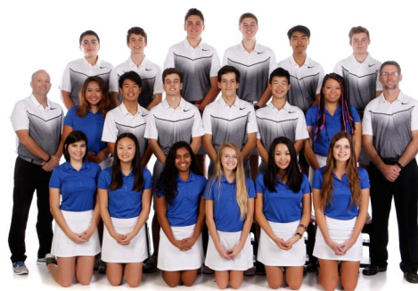
2018 Varsity Golf

Each player may play in up to eight tournaments as well as the district tournament.