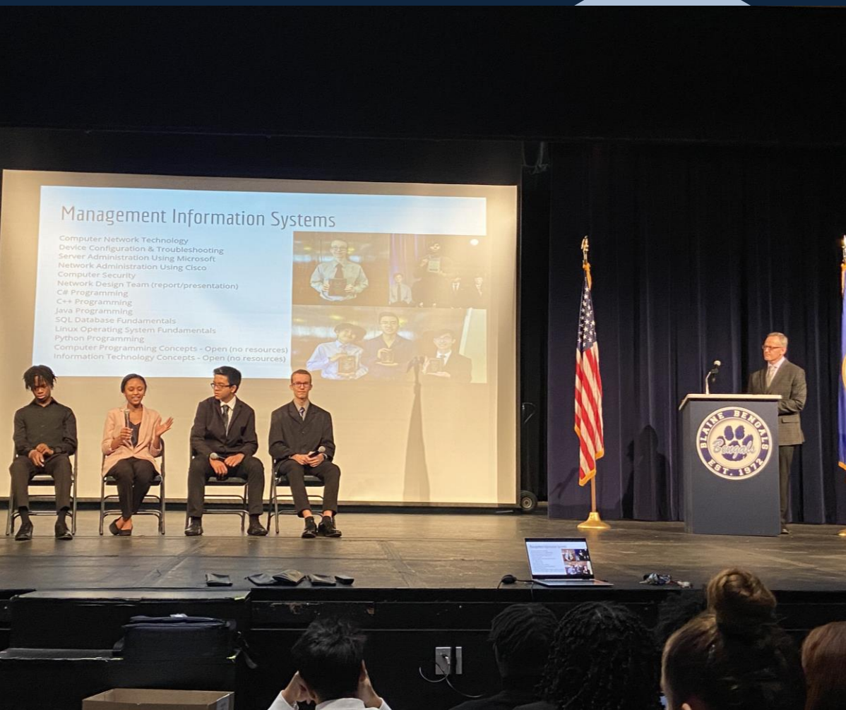
Torch Awards and BPA Cares