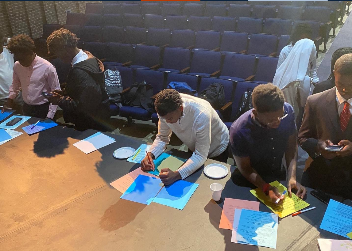
Torch Awards and BPA Cares