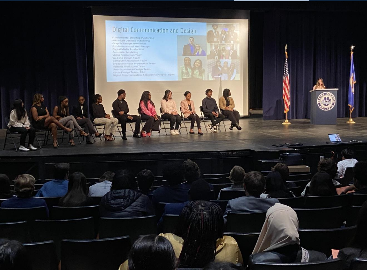
Torch Awards and BPA Cares