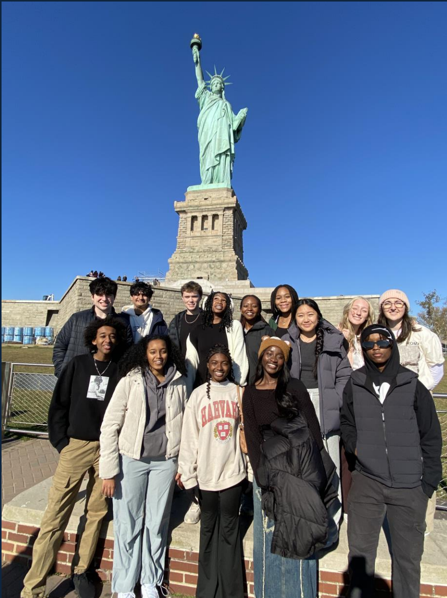
Torch Awards and BPA Cares