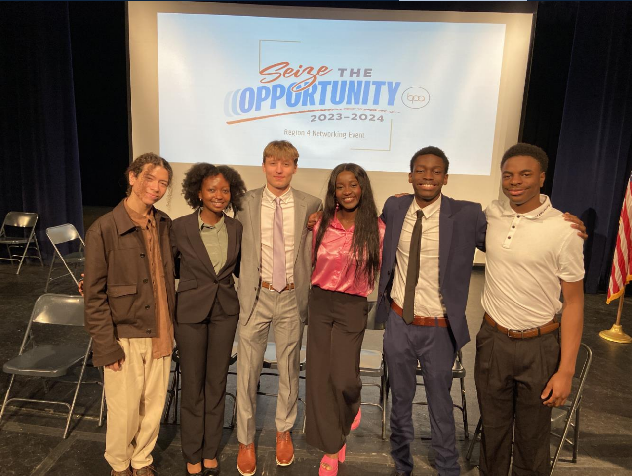
Torch Awards and BPA Cares