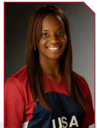
Natasha Watley Elite Athlete Rep