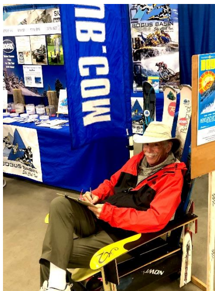
A hopeful winner enjoying this year's chair