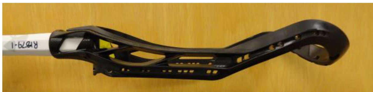
Side View unstrung Spotlight