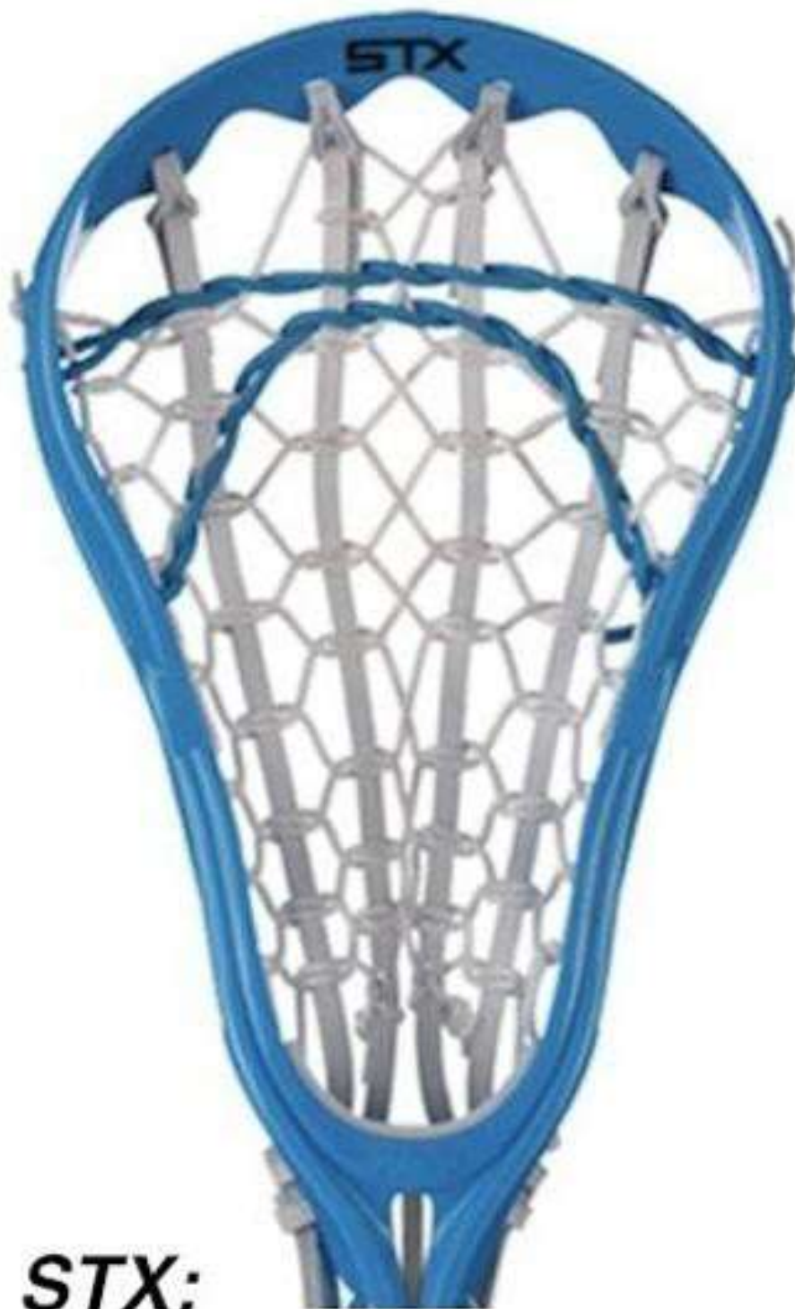
STX: Channel V Pocket