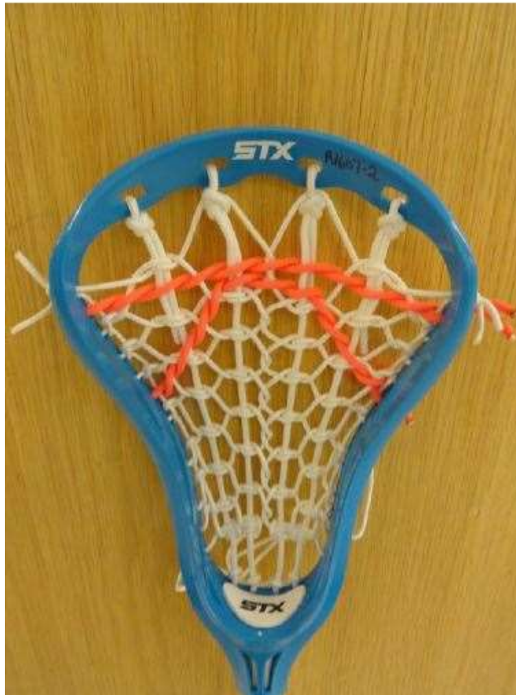
Figure 1. STX Exam 200 head from