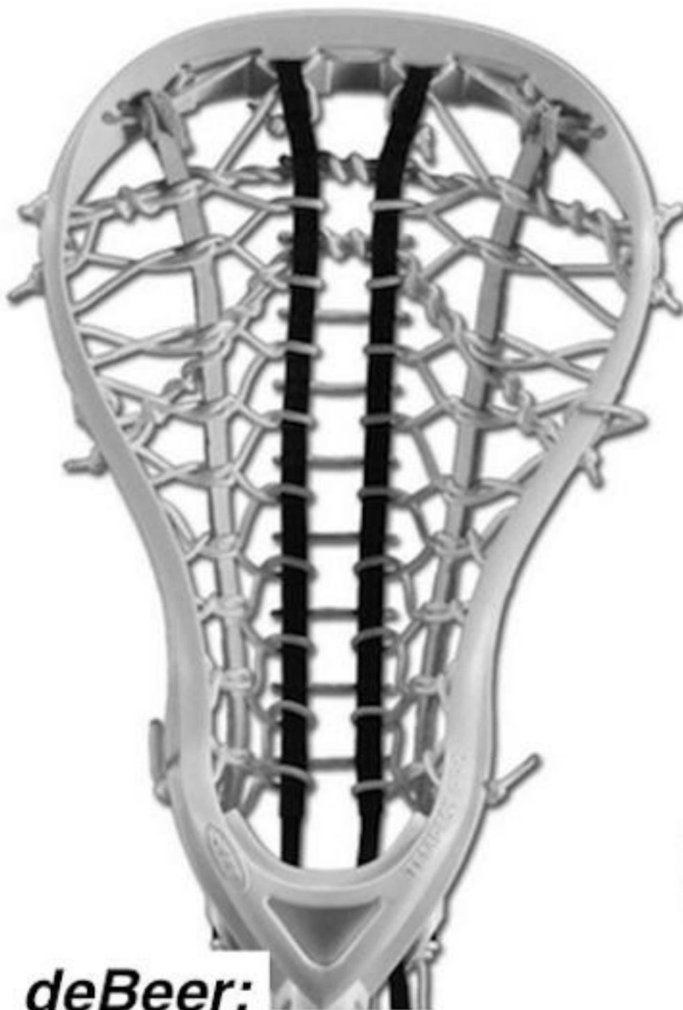
deBeer: GripperPro Pocket