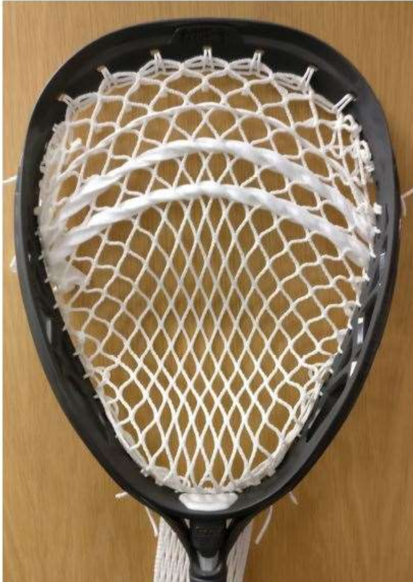
STX Eclipse II