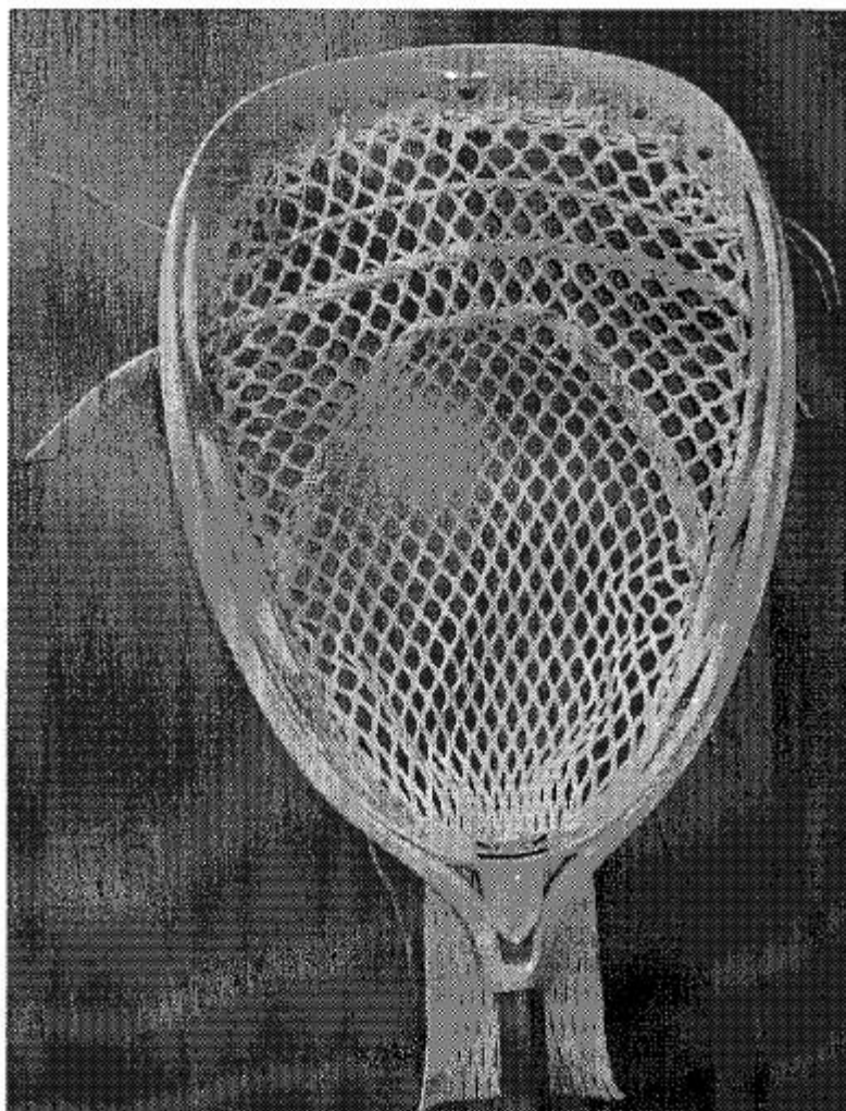
Figure 1: Brine Eraser II goalie head.