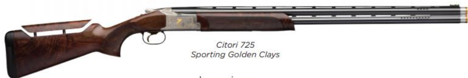
Citori 725 Sporting Golden Clays