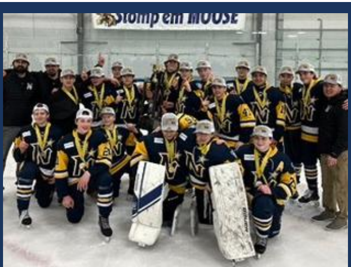
NORTH STARS 14U 2025 STATE CHAMPIONS

Congratulations to the 14U North Star players, coaches, and families on this well-deserved state championship!