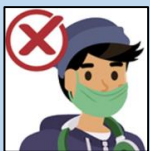
Under the nose