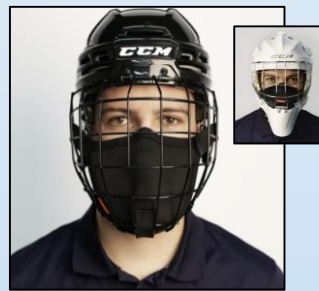
CCM Game On Face Mask (Player & Goalie versions)