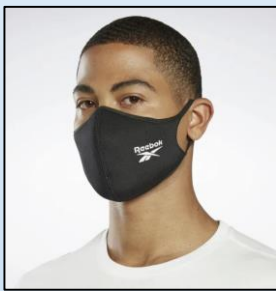
Traditional Cloth Masks (Sports Masks)