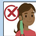
Dangling from ear