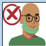
On the chin