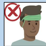
On the forehead