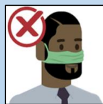
Only on the nose