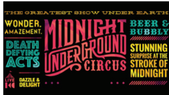
6. T&C TEXT

Ut enim ad minima veniam, quis nostrum exercitationem ullam corporis suscipit laboriosam, nisi ut aliquid. "Lorem ipsum dolor sit amet, consectetur sed do eiusmod tempor incididunt ut labore et dolore magna ad minim veniam, quis nostrud exercitation ullamco laboris nisi ut aliquip ex ea commodo consequat. Duis aute irure dolor in reprehenderit in voluptate velit esse cillum dolore eu fugiat nulla pariatur. Excepteur sint occaecat cupidatat non proident, sunt in culpa qui officia deserunt mollit anim id est laborum. Ut enim ad minima veniam, quis nostrum exercitationem ullam corporis suscipit laboriosam, nisi ut aliquid. "Lorem ipsum dolor sit amet, consectetur adipiscing elit, sed do eiusmod tempor incididunt ut labore et dolore magna aliqua. Ut enim ad minim veniam, quis nostrud exercitation ullamco laboris nisi ut aliquip ex ea commodo consequat. Duis aute irure dolor in reprehenderit in voluptate velit esse cillum dolore eu fugiat nulla pariatur. Excepteur sint occaecat cupidatat non proident, sunt in culpa qui officia deserunt mollit anim id est laborum.