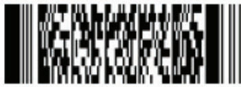
1. 2D BARCODE