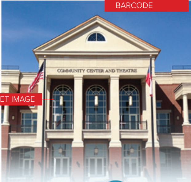
3. TICKET IMAGE