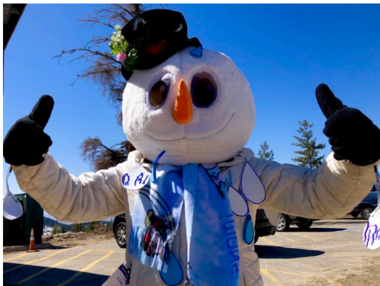
We even had a visit from "Olaf."

Oh! What a festive array of brightly colored costumes! Thank you to everyone who braved the wind and donned your carnivalesque attire for the cause! Our gathering looked more like the staging area for a colorful parade than a spring ski extravaganza. Oh wait. Actually, that is kind of one-in-the-same, isn't it? Our gathering included some Mardi-Gras attire, 80's skirts, Hawaiian shirts, a fictional snowman ["Olaf"], a moose, and a [conscientious] flasher, to name a few.