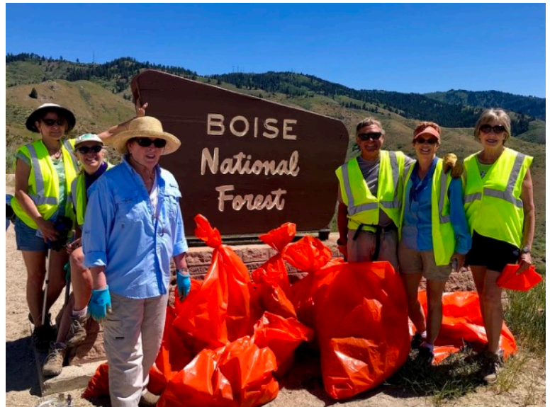
Back at the starting point with our trash.