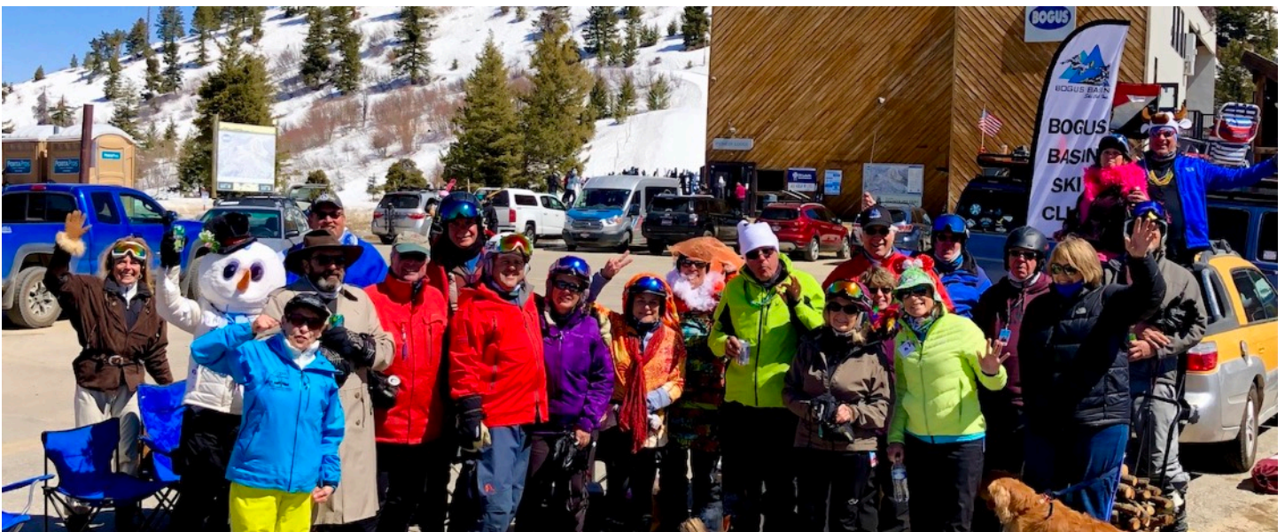
Everyone had a great time!

People's smiles seemed extra big. Or was it just that we could actually see people's faces? Regardless, the collective energy was very positive and celebratory. It felt like we were celebrating an emergence after a long, uninvited hibernation. Wait. Ahem.... We kind of were.