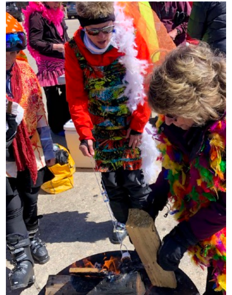
Colorful costumes around the fire pit.