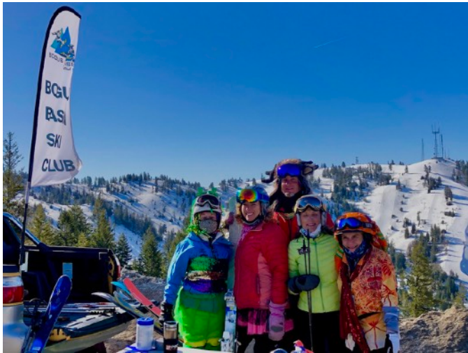
Staging area in Pioneer Lodge Parking Lot.