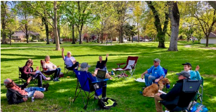
May 4 th BBSC Board Meeting.

It began with our monthly board meetings. For May and June the board met in Elm Grove Park. I must say it was a delight to see dear friends and cohorts in person rather than on a computer screen.