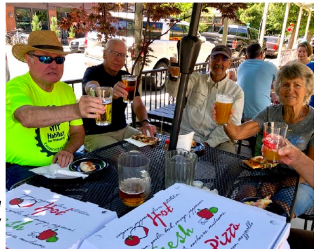
Enjoying good pizza and brew at Sun Ray Cafe.