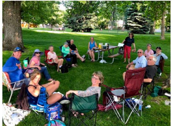
June 1 st BBSC Board Meeting.