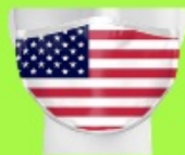
3-PLY SUBLIMATED FLAG MASK