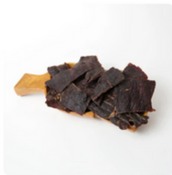
F - Premium Cut Beef Jerky $38.00

REMINDER: if you do NOT sell jerky/coffee or receive donations totaling over $50, your donation check from gear day will be cashed.