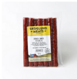
H - Smokey Snack Sticks $24.00