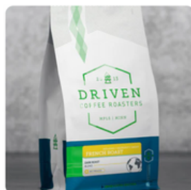
R - French Roast Coffee $22.00