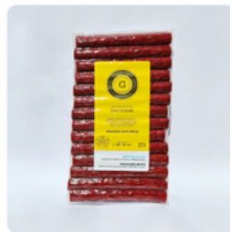
G - Beef Sticks $24.00