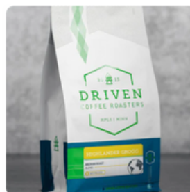
S - Highlander Grogg Coffee $22.00