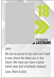
LARGE 5.5 X 8.5