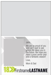
MEDIUM 5.5 X 4.25