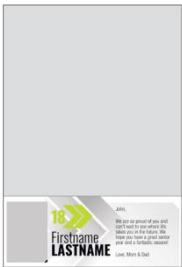
SMALL 5.5 X 2