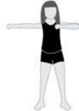
Bow & Arrow