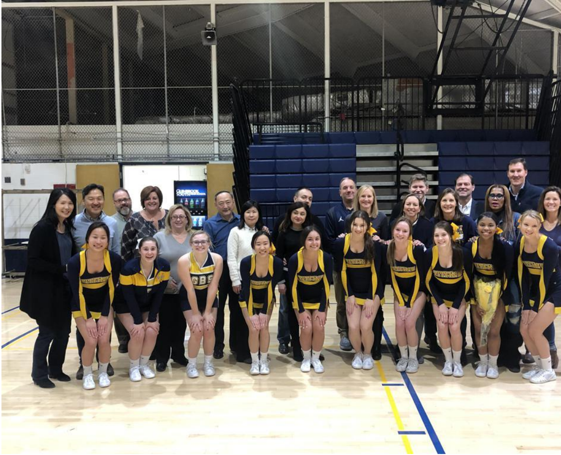
Poms Senior Night