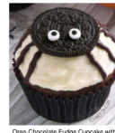
Oreo Chocolate Fudge Cupcake with Oreo Cream Cheese Frosting