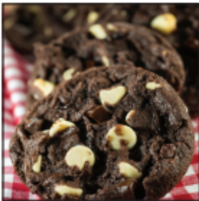
Triple Brownie with White Choc Chip Cookie Dough (40 cookies/box) $20