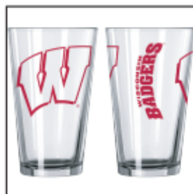
Wisconsin Badgers Pints (2pk) $25