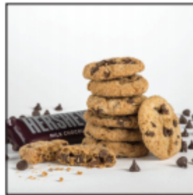
Chocolate Chip Minis (Approx. 100 cookies/2pk 50/bag) $20