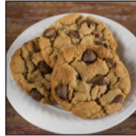
Reese's PB w/Hershey's Choc Chip Cookie Dough (40 cookies/box) $20