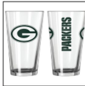
Green Bay Packers Pints (2pk) $25