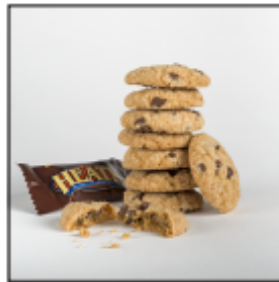
Butter Toffee Heath Minis (Approx. 100 cookies/2pk 50/bag) $20