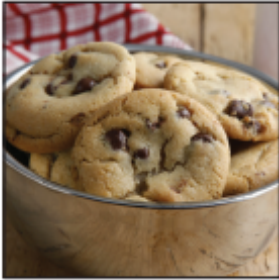
Hershey's Choc Chip Cookie Dough (40 cookies/box) $20