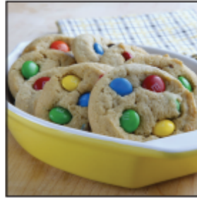
M & M Cookie Dough (40 cookies/box) $20