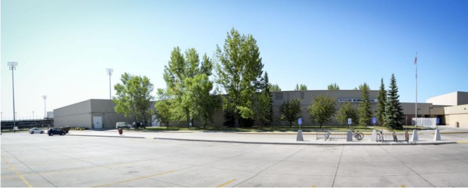
Veterans Memorial Arena is owned and operated by the West Fargo Park District.