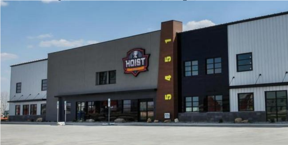
Hoist Hockey is privately owned and operated.