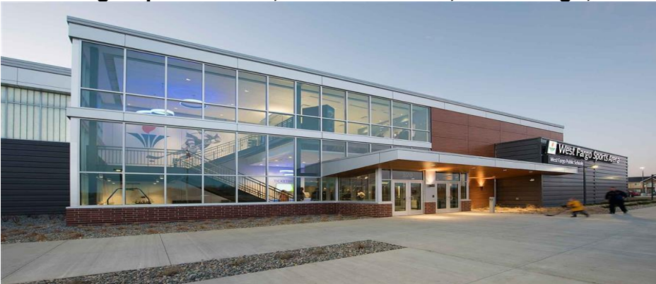
West Fargo Sports Arena is owned by the West Fargo Public Schools and operated by West Fargo Events.