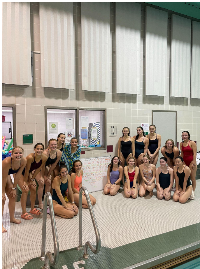
Summer Tree Set Finishers 22. (Endurance is Key)