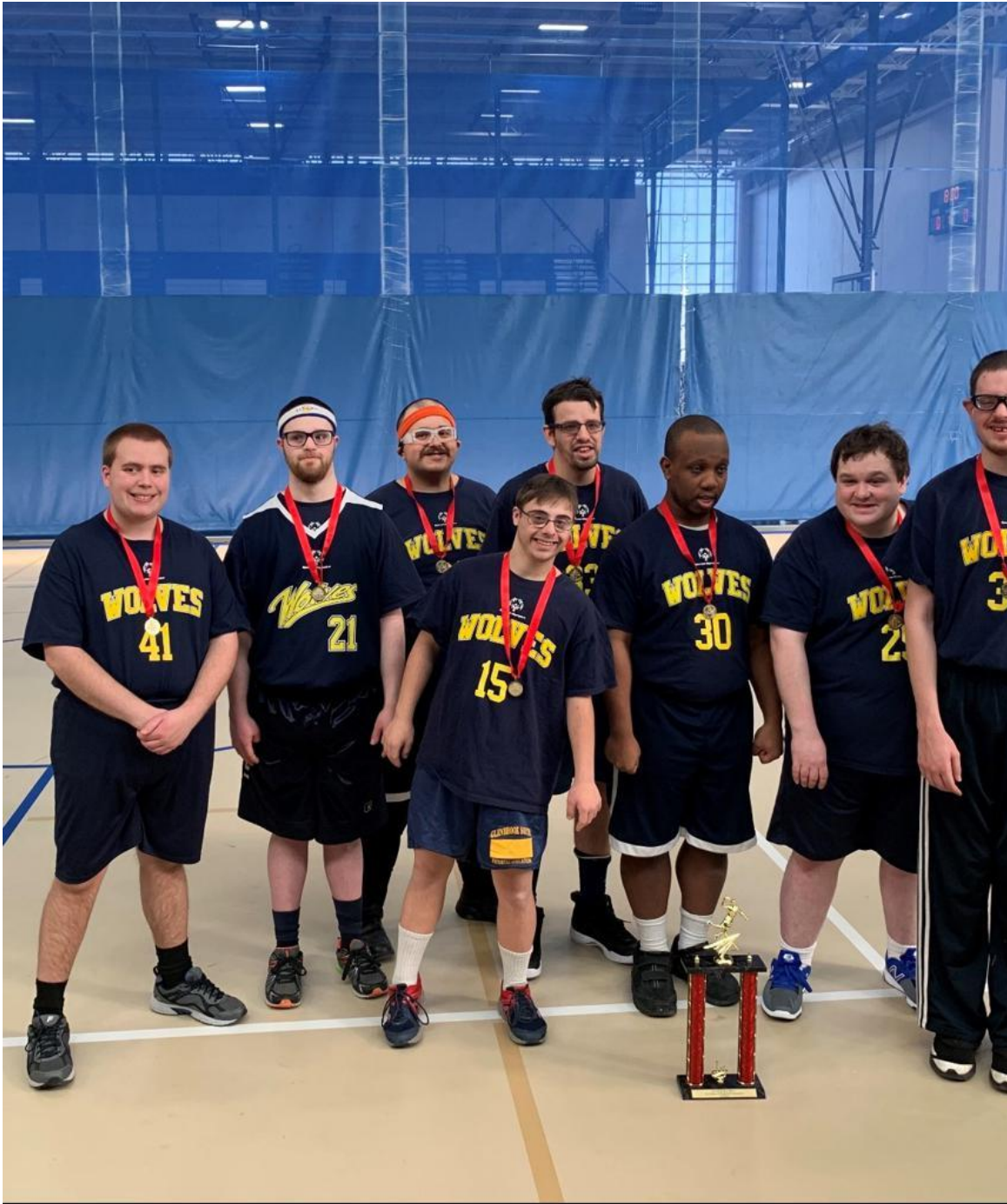
Glenbrook United Basketball Advances to State Championships