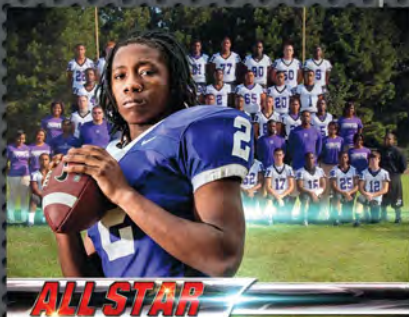
ALL STAR COLLAGE