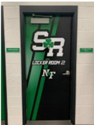
Door Wrap (Lockerrooms)