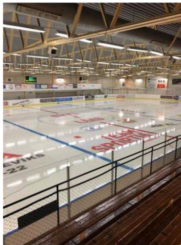
In Ice (Neutral Zone, Blue Line)