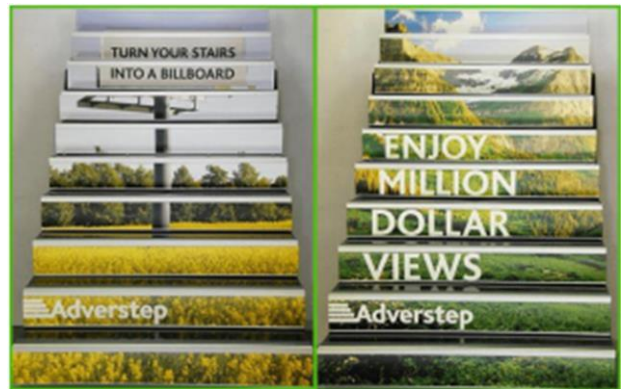
Stair Risers (Bleachers, Lobby)