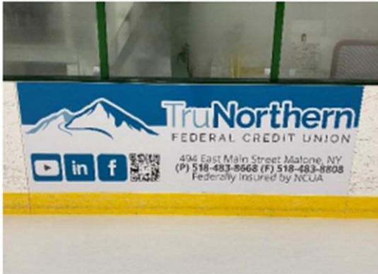
Dasher Board (33" x 96")