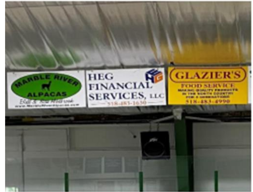
Hanging Board (30" x 48")