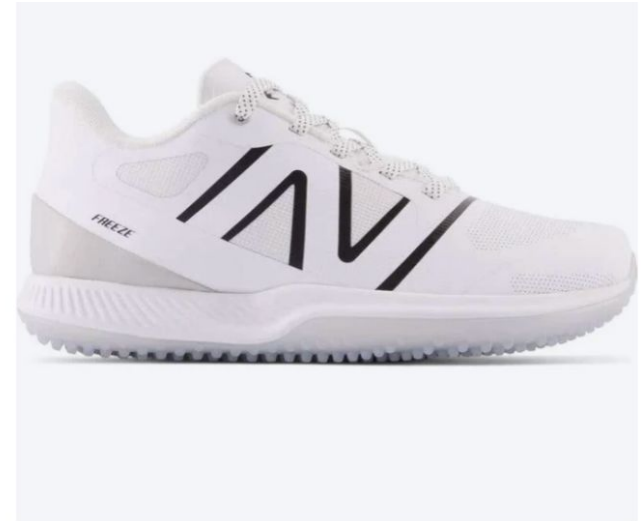
New Balance ★ 5 (17) New Balance Freeze 4.0 Lacrosse Turf Shoes $53.99 $104.99 ○ ●