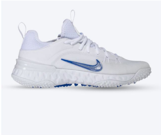
Nike ★ 5 (1) Nike Huarache 9 Elite Lacrosse Turf Shoes $100 ● ● ● ●

Turf Shoes or Trail Runners will be best for the AZ Fields!