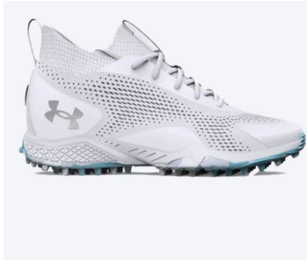
Under Armour ★ 5 (4) Under Armour Glory 2 Women's Lacrosse Turf Shoes $90