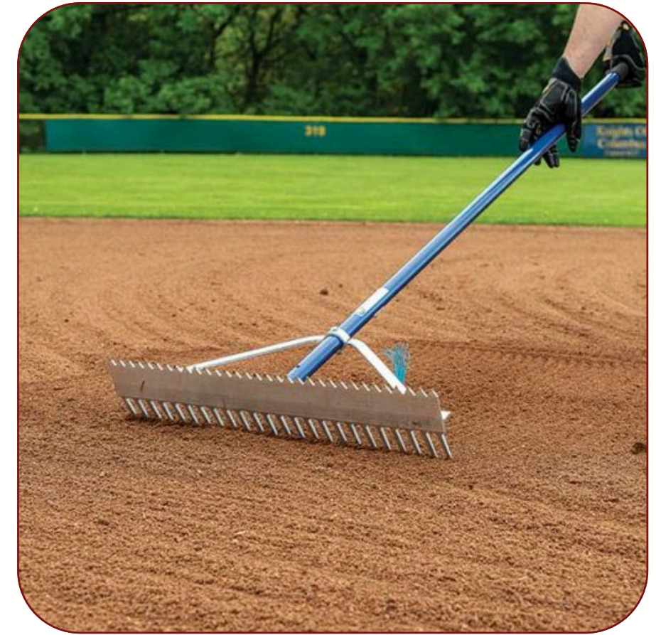
PLEASE RAKE FIELDS AFTER USE