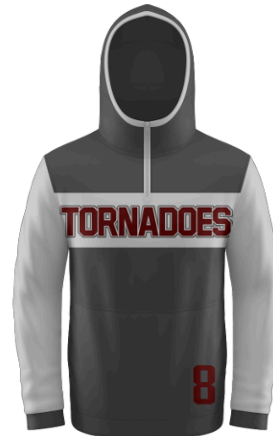
Player & Coach Hoodie