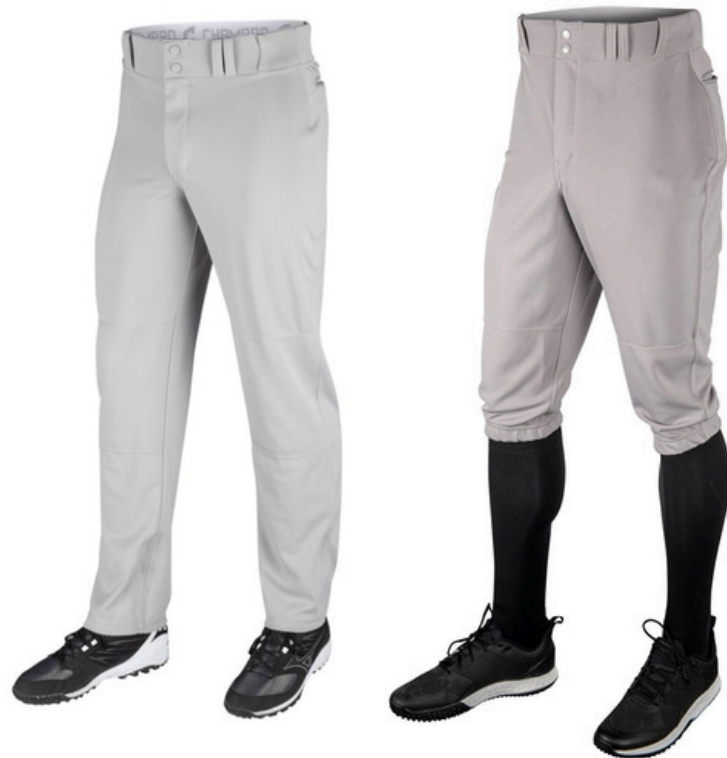
Grey Baseball Pants