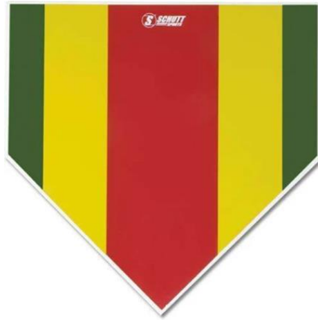
Power Pod Training Aid