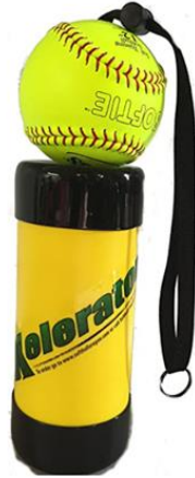
Ernie Parker Wrist Snappers