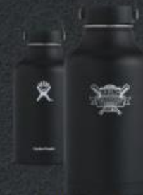
Hydro Flask $65 ARV