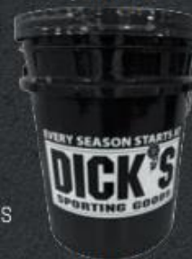
Bucket $15 ARV