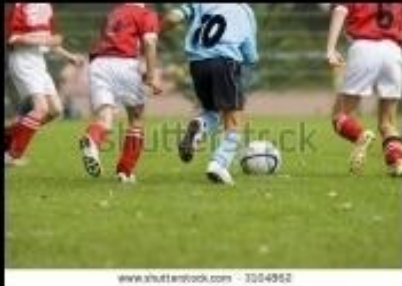
What my parents think I do