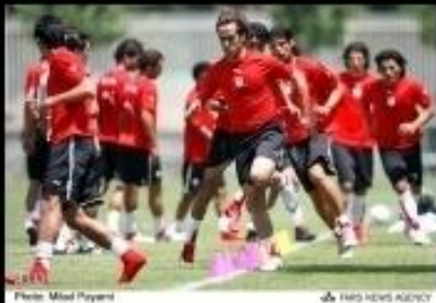
What my coach thinks I Do