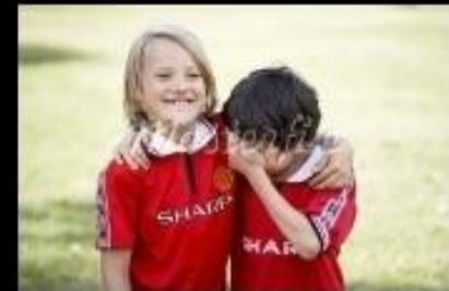
What I really do