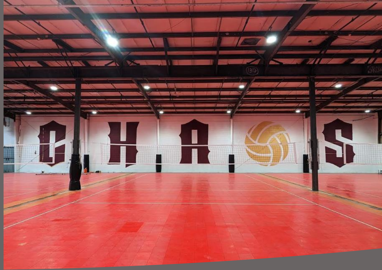
Chaos Gym 13560 SE Pheasant Ct. Portland, Oregon 97222

Valley View Church Gym 11501 SE Sunnyside Rd, Clackamas, Oregon 97015