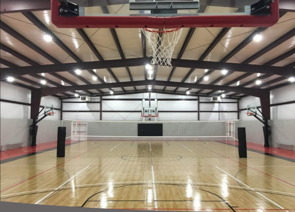
Dalzell Gym 17951 SE Hemrich Rd. Damascus, OR 97089