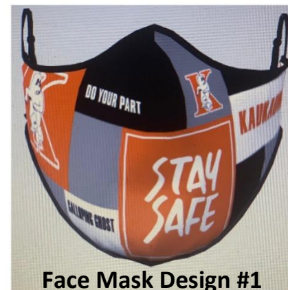
Face Mask Design #1