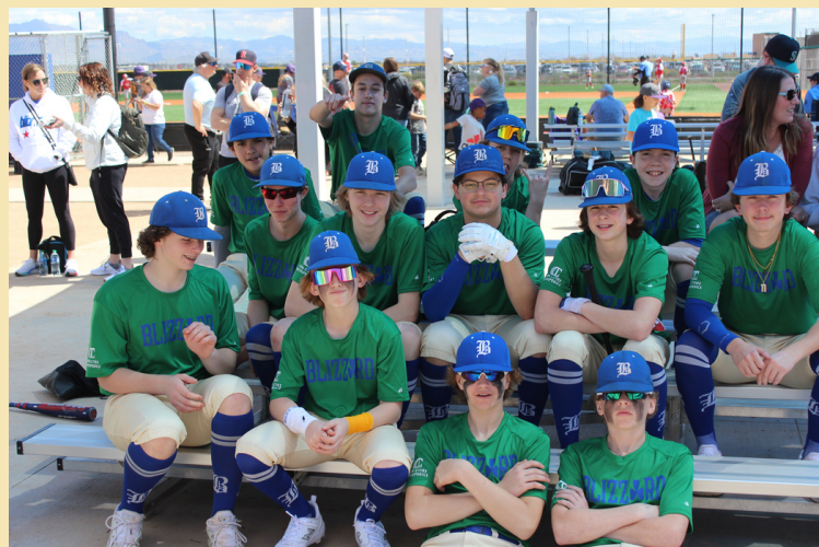
14U relaxes prior to second Exhibition game