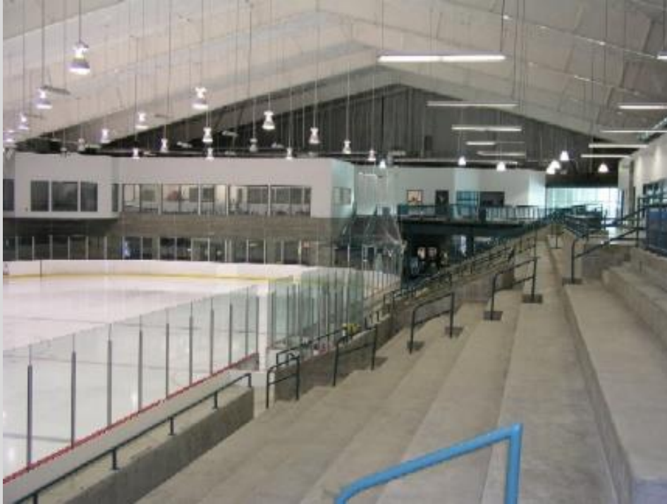
Interior of Kent Valley Ice Centre