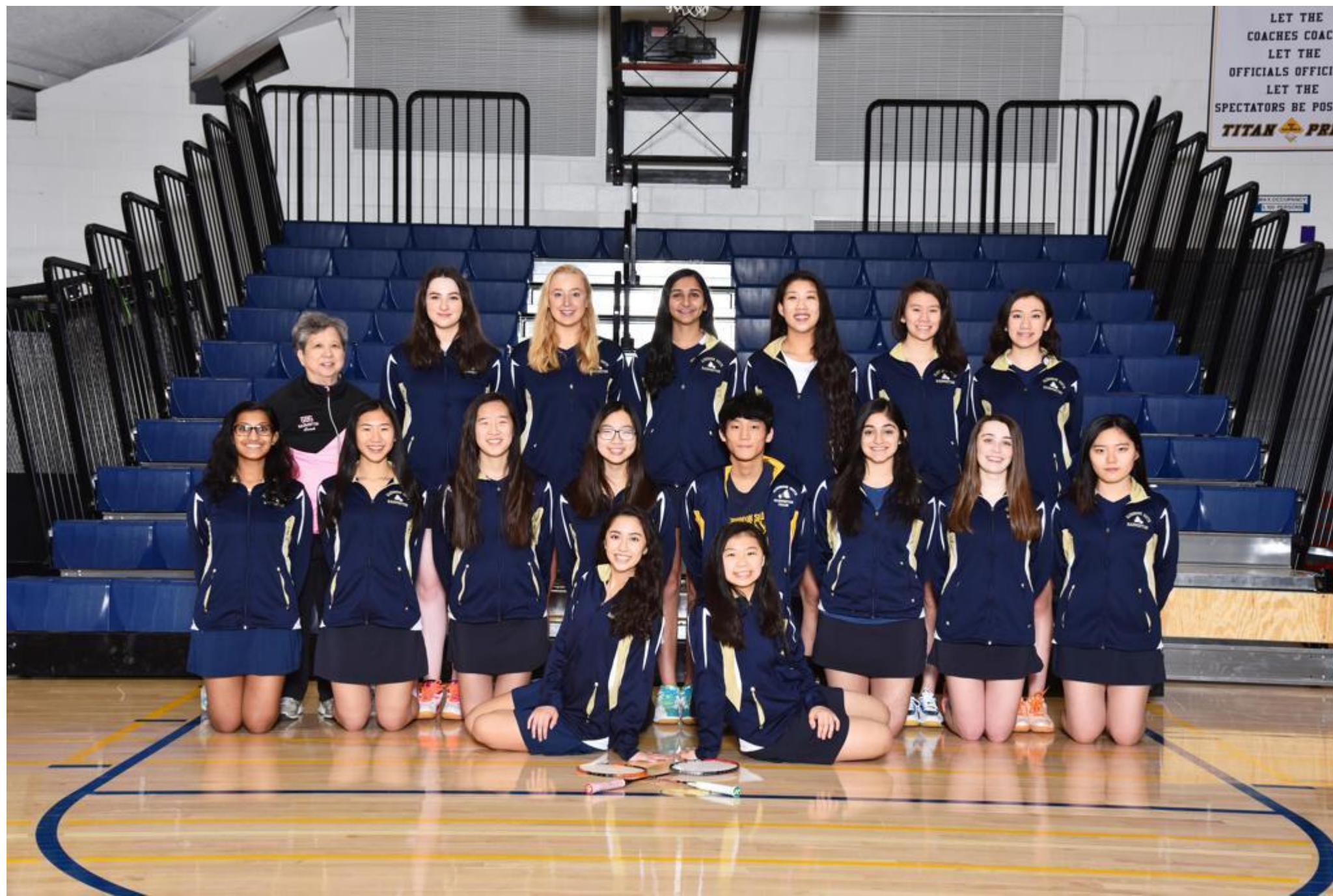
Badminton Has Another Winning Week!