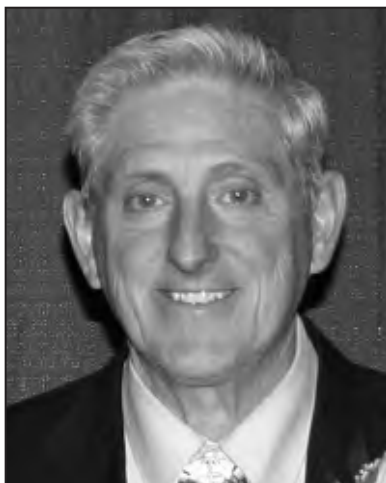
Galen Busch Mission