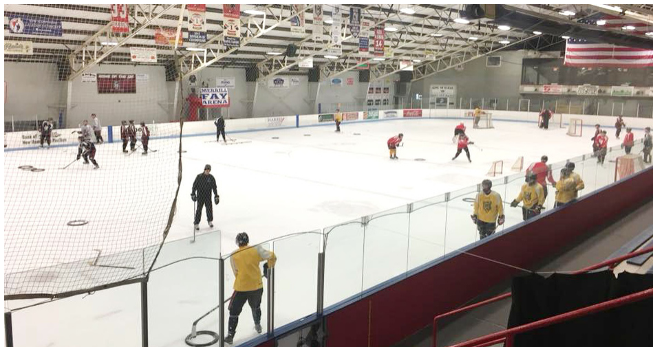
The New England Wolves go through a position-specific practice session at the Merrill Fay Arena.