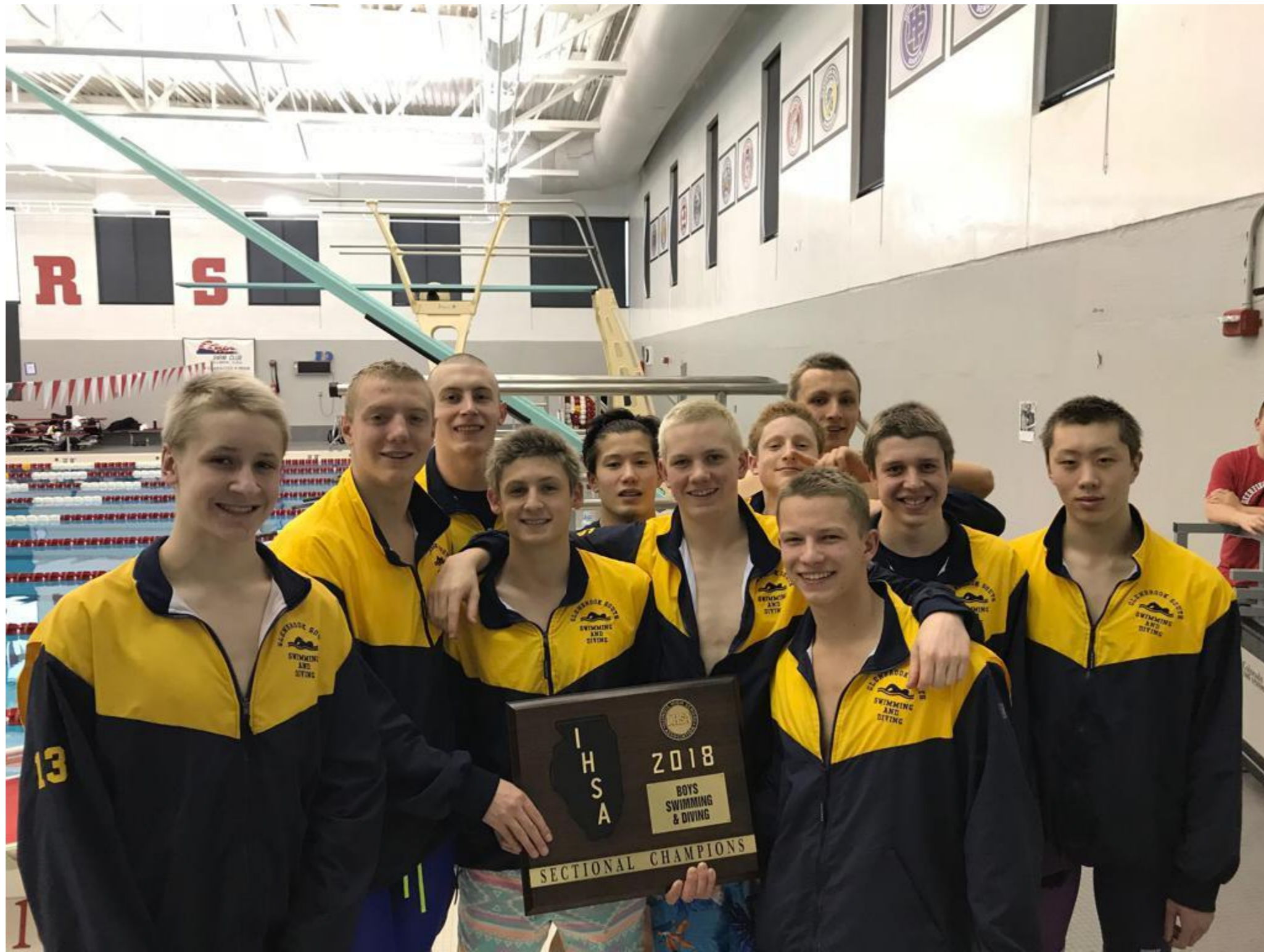
Boys Swimming & Diving