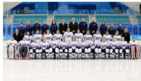
BOTTOM ROW (L-R): Alex Rigsby, Maddie Rooney, Kendall Coyne, Amanda Kessel, Lee Stecklein, alternate captain Brianna Decker, captain Meghan Duggan, alternate captain Kacey Bellamy, Hilary Knight, Jocelyne Lamoureux-Davidson, Monique Lamoureux-Morando, Nicole Hensley