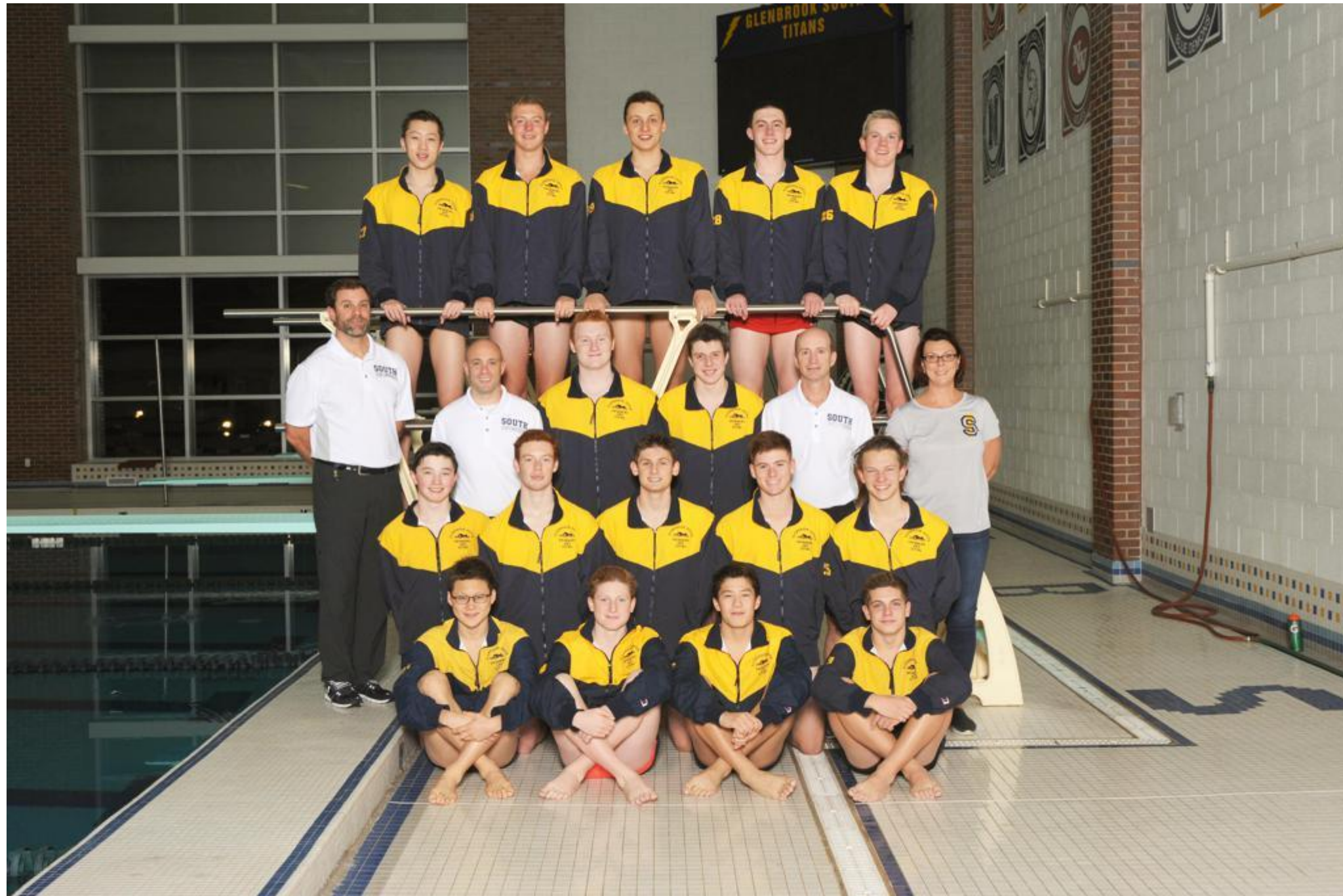
Boys Swimming & Diving