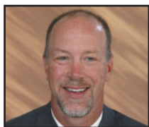
Mike Ramsey Buffalo Sabres 1980 U.S. Olympian