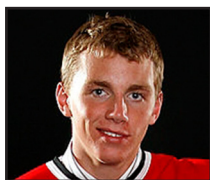
Patrick Kane Buffalo, N.Y. native 3x Stanley Cup Champ