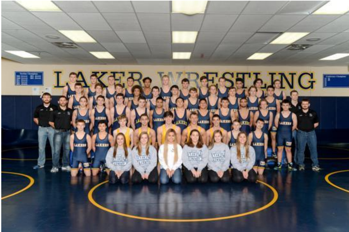
High School Wrestling Team