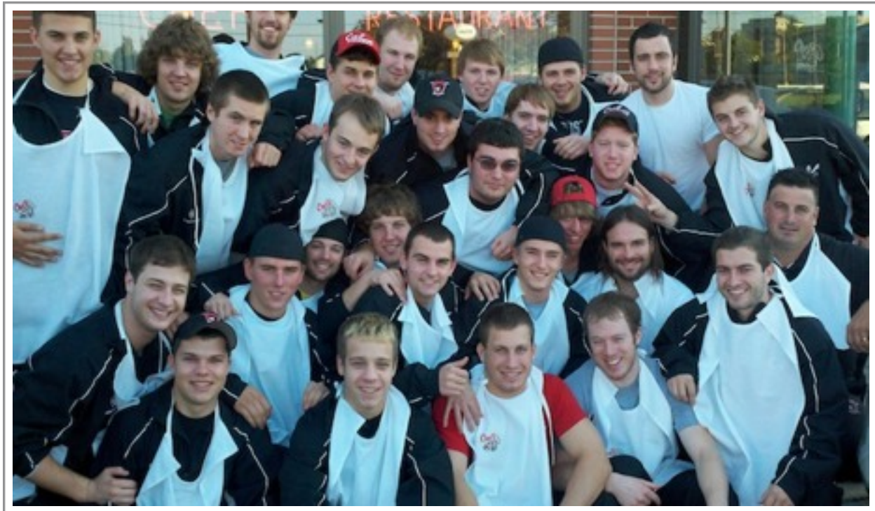
Vulcans share a team dinner during their opening road trip last season