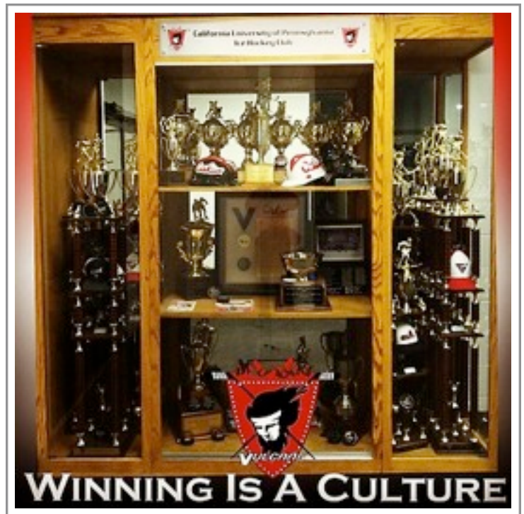
The California University of Pennsylvania Ice Hockey Club's trophy case located in the front of the Bethel Park BladeRunners.