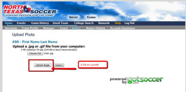
Fig 4 Click on upload tab